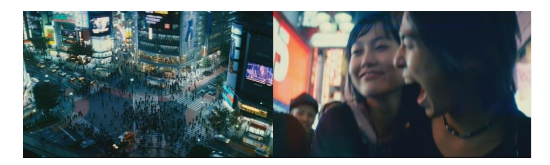
Figs. 3 and 4. Babel (Alejandro González Iñárritu, 2006)

One of the key criticisms of fast contemporary cinema is that an increase in image velocity has resulted in a decrease in complexity and substance. A sequence of fast cuts and shifting images in Babel (Alejandro González Iñárritu, 2006) negates this assumption by directly communicating the excitement and anticipation of adolescence, the importance of music in constructing tone and mood in cinema, as well as the ability for fast sequences to project a heightened level of cinematic meaning. As Chieko, a Japanese deaf-mute teenager meets up with friends and embarks on a drug-fuelled night in a Tokyo club, Iñárritu communicates her dislocation from reality through a series of fast temporal and aural dislocations.