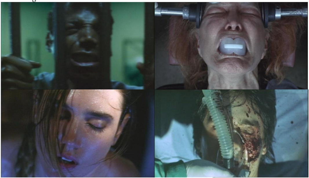
Figs. 7–10. Requiem for a Dream (Darren Aronofsky, 2000)

As the sequence progresses, the film cuts more rapidly between the three unnerving storylines, while the music becomes even more expressionistic and fast, even more urgent and grating. Harry and Tyrone are arrested when they try to get Harry's gangrenous arm looked at in a hospital. In prison they are separated, and Aronofsky turns to techniques of temporal distortion and CGI in order to communicate their dislocation from reality. Tyrone grasps the bars of his cell as the world around him shakes and oscillates at amazing speed, while Harry lies on a bed sweating in agony, unable to control either his own movements or the pain. As the pair scream for help, the camera vibrates faster and faster, while the music becomes a series of high-speed blips and scratches, so that the rhythm of the edit and the beat seems to be generated by their intensifying anguish. Again, the cuts between the four characters increase in speed as Marion once more returns to the pimp's house to earn drug money through sex.