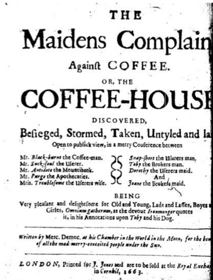
Fig. 4. The Maidens Complaint Against Coffee (1674).

These texts were used by Victorian historians, and subsequently by others in the twentieth century, as evidence for what coffee-house-going was like. And there may be some truth in these depictions — it is true that women were not expected to be in the coffee-house, and Dorothy and Jane are standing outside it, lamenting the fact that it is full of men inside. But this is obviously complicated evidence of an experience, because it is satirical, because of its interest in using low and vulgar language. It uses these satirical modes of the mock petition or complaint, different forms of the genres of authority that they burlesque and travesty.