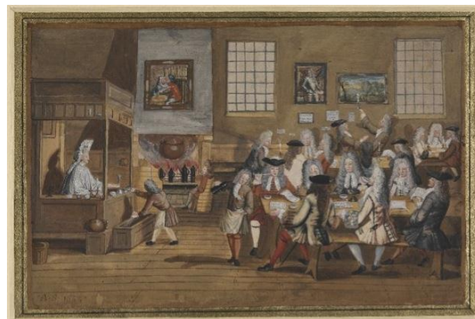
Fig. 3. 'Interior of a London Coffee House in 1668' (c. 1705).

What this argument suggests is that cultural history is related to or a critique of diverse historiographical forebears. That's relevant and interesting, but cultural history has an equally profound relationship with English Studies, or more generally, those disciplines focused on mediated evidence, such as literary studies, other languages, music history, art history.