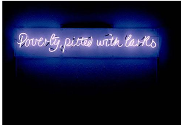
Fig.5. Ian Hamilton Finlay, Poverty, pitted with larks , accessed at http://dailyserver.com/2007/03/ian-hamilton-finlay/ [accessed on 09 August 2011].

The examples here are instant, like statements, and play on ideas of slogans and functional signs, but they gesture towards a meaning rather than conclude anything.