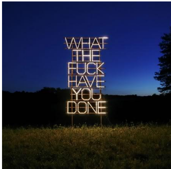
Fig.6. Phillipe L'Home, photographed by Michael Roulier, accessed at http://flux-boston.com/?p=21 [accessed on 09 August 2011].

Through gesture, the poems achieve brevity in their combination of optical and textual presence, or wordplay laid out.