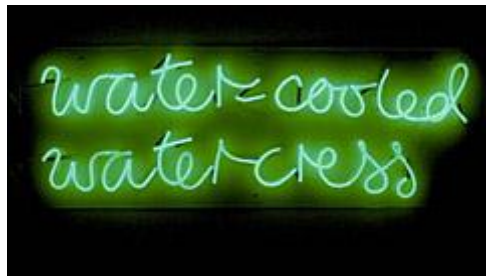
Fig.4. Ian Hamilton Finlay, Water-Cooled Watercress (1989), accessed at < http://www.victoria-miro.com/exhibitions/_376/ > [accessed 09 August 2011].

Now I want to come off the page, to a more physical example of text presence in space.