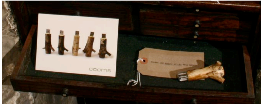
Figure 4: OOOMS, Wooden USB Stick, 8 x 2 cm, 2009

The notion of the tree as a recording technology is explored punningly in OOOMS's designer memory sticks. Part USB, part polished wood, the devices become a group of memory stick figures, placed in a playful anthropomorphic series (Figure 4). 5 While much of the exhibit's archive of wooden artefacts is positioned on easels and bookstands to lean back as if in partial resistance from us, these figural pieces of wood wittily seem available to evoke an archival backup of us.