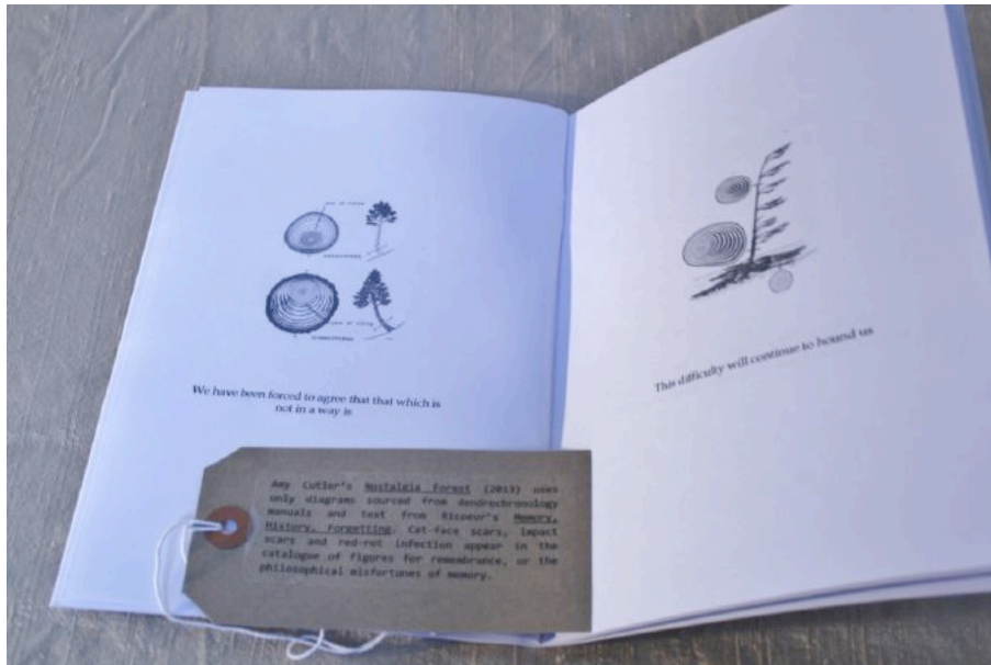
Figure 6: Will Montgomery and Carol Watts, T.R.E.E. , handmade book and audio recording, 2013

The untied cords of the labels, leaning upon their artefacts, remain open to other re-recordings, to other patterns of tree recording. Future installations of the current collection could productively continue to explore the form of the arboreal exhibition with the addition of judicious defoliation and dells; of spaces to support individual pieces that could otherwise be compromised by the overarching aesthetic of a woodland space slanted by shadows. Critical questions about the potential ecological or difficulties of forest memories, such as anthropocentrism or externalisation, would also be a welcome addition to the strong curatorial material on this excellent collection. The fascination of these tilting trees demands scope to branch out into new locations.