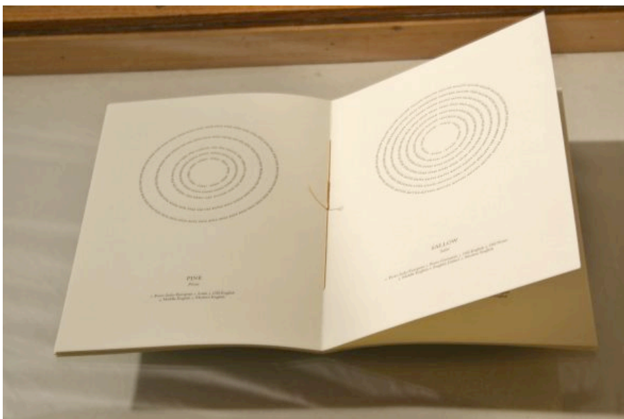
Figure 3: Richard Skelton and Autumn Richardson, Relics (Cumbria: Corbel Stone Press, 2013)

Cutler's curatorial approach stimulatingly tilts the resonances of the dendrochronological slice several ways: tree rings are also suggested lexically in Relics by Richard Skelton and Autumn Richardson. Concentric circles of text chart linguistic change in the names of lost tree genera (Figure 3). 4 The grooves of type that document phonological change are reminiscent of the gramophone record: the etymological memory ascribed to each tree recalls an obsolescent technology.