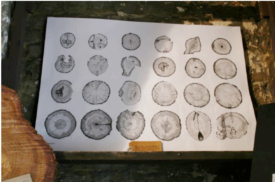
Figure 2: Gail Ritchie, For The Fallen , pencil on Hahnemühle paper, 30 x 30 cm, 2009-13.

The wounded cross-section becomes a diagrammatic motif for memorialising the trauma of those lost in battle in Gail Ritchie's For The Fallen , a drawing series of tree slices, themselves sliced into the paper in sharp 6H pencil (Figure 2). 3