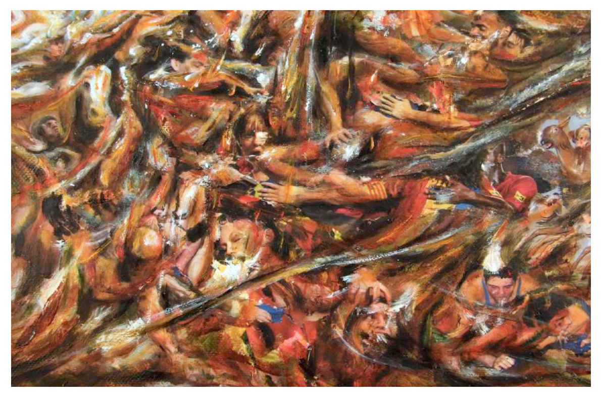
Vonbrota, It is only by Libido alone that the Cosmos survives (detail) 2011. Collage, acrylic and oil painting on canvas.