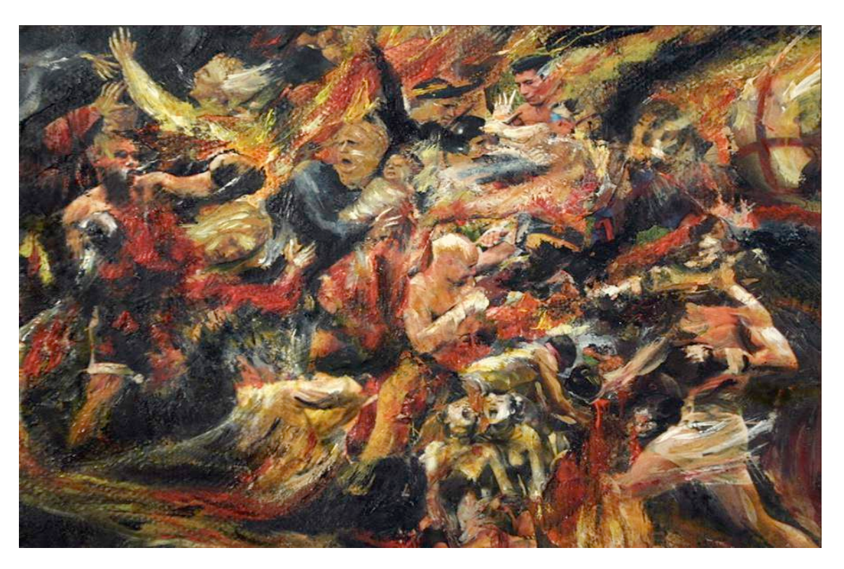
Vonbrota, On the Deathbed: Ostentation (detail) 2010. Collage, acrylic and oil painting on canvas.