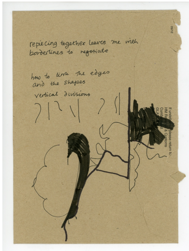
Ruth Solomons, Back of Envelope Drawing 7 , 2013, pen on back of envelope