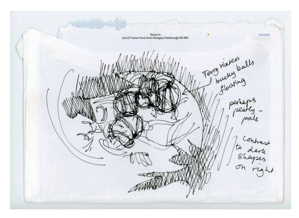
Ruth Solomons, Back of Envelope Drawing 20, 2012, pen on back of envelope